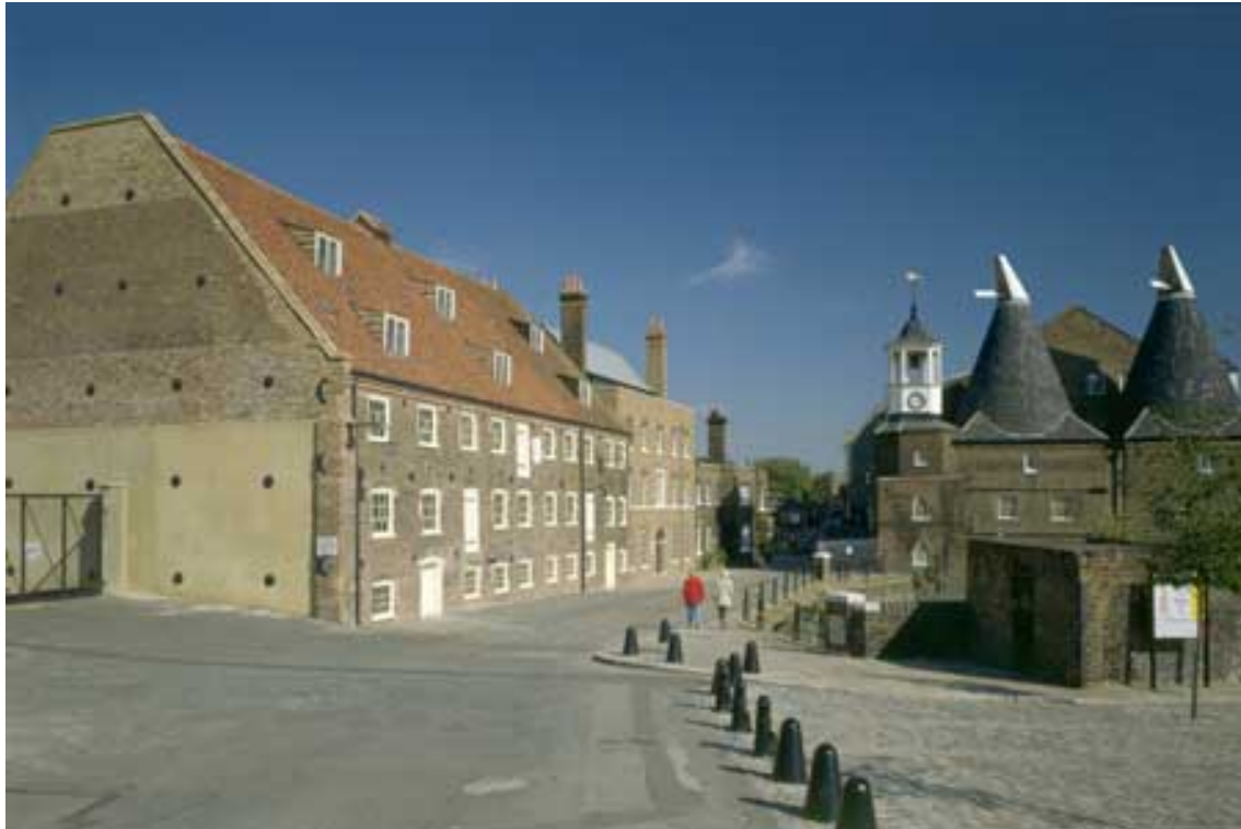
1997 Photo of Three Mills Ref: K971567

the official accounts not only of bottling but what went in and out of the Bond. I went to Three Mills about twenty years later on a form of inspection and the bottling halls had been recast and were staffed almost entirely by men whose ethnic origin seemed to be overwhelmingly from Pakistan; all very different.