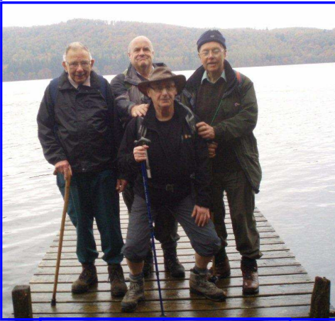
Monday 31st October

Monday 31 Oct. (5.5 miles). Five walkers braved the elements and walked along Windermere lake shore, over Queen Adelaide's View and over Orrest head prior to lunch in the Queens Hotel in Windermere. Rain set in for the return leg through the park and the bedraggled group retired to the Hole Int Wall pub in Bowness after returning to the Hydro.