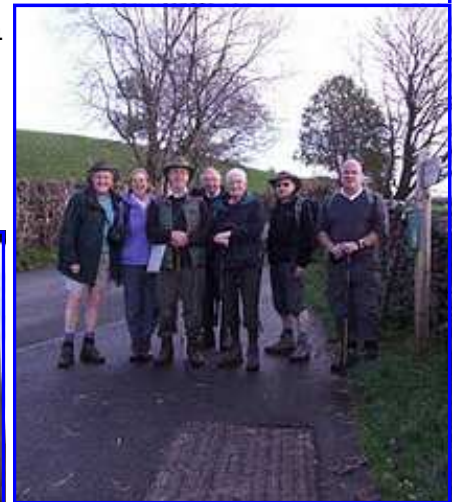
Tuesday 1st November

Wednesday 2 Nov. (5 miles). Nine walkers set off from Elterwater along the flat riverside path to Skelwith Bridge where three walkers looped