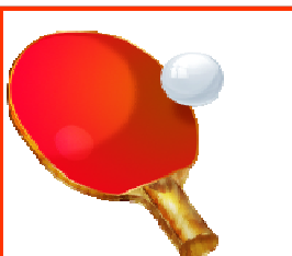
Table Tennis .....

Page 6 Regional Contacts & Officers of FOCERRSA & RMS of RCSL.